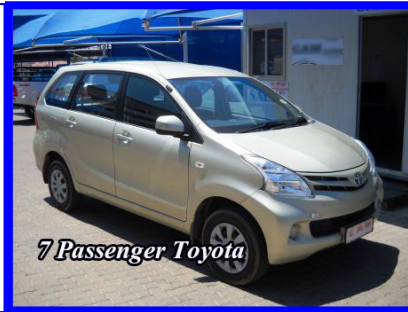
7 Passenger Toyota